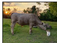
2 nd Place New Friends by Ester Kelly