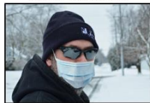
2 nd Place