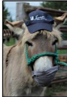
1 st Place