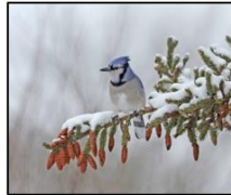
1 st Place Blue Jay by Shirley Godderts