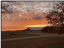
1 st Place Harvest by Erin Warboys