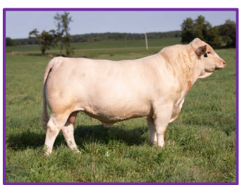
Grand Champion Charolais Bull Barrie Fair Rolling Acres Charolais, Mulmer, ON & Dudgeon-Snobelen Land and Cattle, Ripley, ON

Grand Champion Bull New York State Fair Maple Stone Farm East Garfraxa, ON