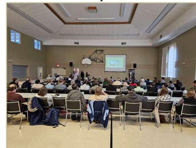
The crowd engages in the discussion in Floradale.