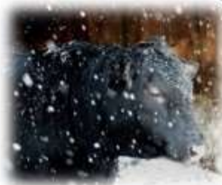
Spring 2020 Winter Scenes

Submit your photos to mediateam@jfm.ca .