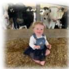
Spring 2020 Farm Families Winner