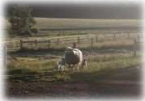
Spring 2020 Spring Babies Winner