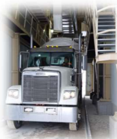
The first load of feed being loaded out of the new mill 01/21/20

Last month, and right on schedule, the switches were hit to fire up the new George Robert Jones Production Plant. Everything seems to be going smoothly so far, and though we will be in the testing phase for some time, we are excited to see the commodities going in and the feed coming out! Stay tuned for more updates on this history-making time at JFM.