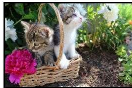
2 nd Place Spring Babies by Amanda Lebold