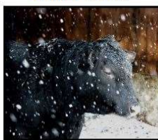
1 st Place Snowy Bull by Michaela Chalmers