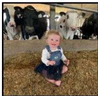
1 st Place Visiting the Cows by Erin Dale