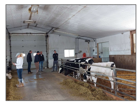
Calf College Participants view calves on the Jones Whole Start Program